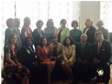
CMSA's 2017-2018 Board of Directors